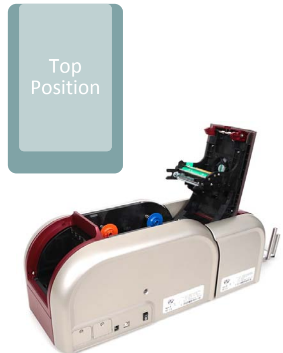
2XCR 100 with optional Flipturn Unit