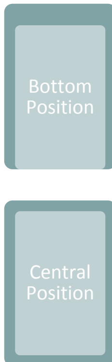
possible Positions on CR-100 cards